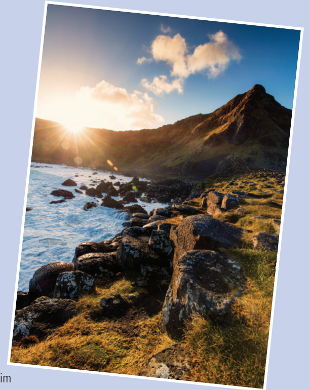
The Horseshoe, Ballintoy, Co. Antrim